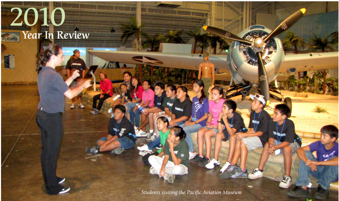
Students visiting the Pacific Aviation Museum

In 2010, the Directors of the Atherton Family Foundation distributed more than $4.2 million in grant awards. Each year, the Foundation makes grants to a diverse range of nonprofit organizations providing services that vastly benefit the people of Hawaii. As reflected in this year's grants list, the areas supported range from education to youth development to arts and culture to health and human services. The Foundation has provided funding for innovative direct services and numerous capital projects to benefit the community for years to come.