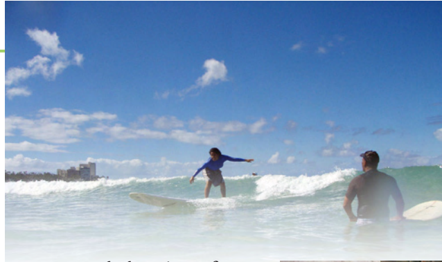
Left, Surfrider Spirit Sessions surfing session; Below, HI HOPES Board Members of the Hawaii Youth Opportunities Initiative.

Wilcox Hall. The 1,507 square foot Creative Learning Center is a large, flexible space equipped with a full kitchen that allows teachers and students to experiment with preparing and cooking foods the students grow in their garden planters.